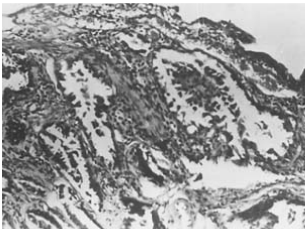
Figure 1. Hobnail appearance of tumor cells in back to back glandular architecture of the tumor.