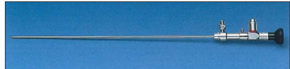
FIGURE 2: Small hysteroscope, diameter 2.9 mm.

comparable to or better than that of standart 4 mm telescopes (Table 2), 15 (Figure 2, Small hysteroscope, diameter 2.9 mm). It is noteworthy to understand that a wider angle of view allows better visualization of the cavity with less manipulation of the instrument. Moreover, a wider visual field offers brighter visualization with better image bundles as well. The improvement in fiberoptic technology has allowed the realization of both rigid and flexible small-diameter hysteroscopes. Small-diameter fiberoptic hysteroscopes are more damage resistant compared with lens-based instruments and have the additional advantage that in the same diameter they allow the introduction of larger operative instruments with greater surgical potentiality. However, even the great improvements in fiberoptic technology, it cannot match image quality of a rod-lens-based telescope system. Another disadvantage of fiberoptic technology is the standart 0 degree angle of vision (Figure 3, Continuous-flow resektoscope). Cavity exploration is better with a 30-degree endoscope. Moreover, the flat (not fluted) tip of the introduction through a stenotic cervix may be more difficult than with a 30-degree rigid hysteroscope. 13