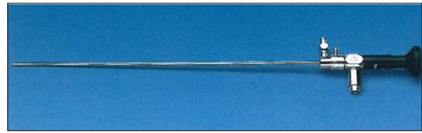
FIGURE 1: Mini hysteroscope, diameter 2 mm.

The employment of mini telescopes may raise concern about their quality of vision and resistance compared with standart 4 mm telescopes. However, thanks to recent technological improvements, new lens-based mini telescopes have a very high visual quality. New, narrow-diameter lens-based telescopes range in diameter from 2 to 2.9 mm (Figure 1, Mini hysteroscope, diameter 2 mm). The brightness, angle of view, and field of view are