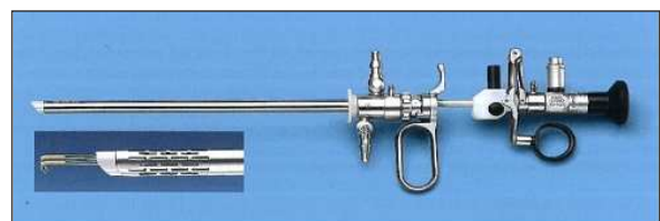
FIGURE 3: Continuous-flow resektoscope.

comparable to or better than that of standart 4 mm telescopes (Table 2), 15 (Figure 2, Small hysteroscope, diameter 2.9 mm). It is noteworthy to understand that a wider angle of view allows better visualization of the cavity with less manipulation of the instrument. Moreover, a wider visual field offers brighter visualization with better image bundles as well. The improvement in fiberoptic technology has allowed the realization of both rigid and flexible small-diameter hysteroscopes. Small-diameter fiberoptic hysteroscopes are more damage resistant compared with lens-based instruments and have the additional advantage that in the same diameter they allow the introduction of larger operative instruments with greater surgical potentiality. However, even the great improvements in fiberoptic technology, it cannot match image quality of a rod-lens-based telescope system. Another disadvantage of fiberoptic technology is the standart 0 degree angle of vision (Figure 3, Continuous-flow resektoscope). Cavity exploration is better with a 30-degree endoscope. Moreover, the flat (not fluted) tip of the introduction through a stenotic cervix may be more difficult than with a 30-degree rigid hysteroscope. 13