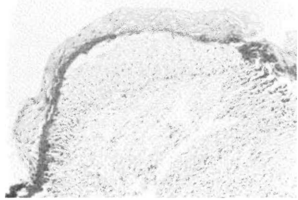
Figure 2 CIN I lesion with findings consistent with HPV infection (tissue section).

It is well known that HPV is associated with CIN and invasive carcinoma (2). Unfortunately diagnosis of HPV infection has increased in incidence so that now may be the most common sexually transmitted disease (4). There might be no difference between HPV (+) and (-) cases clinically and colposcopically but by cytopathologic evaluation this certainty could be stated. If the characteristic cytologic and histologic findings consistent with HPV infection are noted, over 95% of such cases will be detected to contain the virus (4). In our study, out of 50 CIN cases, 17 have