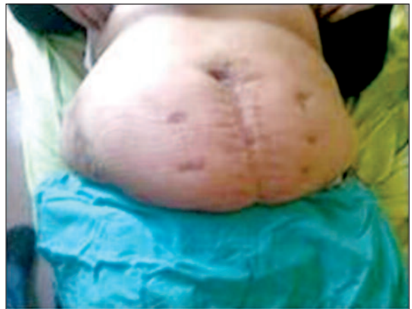
FIGURE 3: Appearance of the incision line 6 months after the operation. (See color figure at http://jinekoloji.turkiyeklinikleri.com/ )

perforation, hematoma, ACS and strangulation of a hernial sac for the differential diagnosis of the postoperative abdominal distension. ACS which is one of this complications is an extremely rare and highly mortal complication.