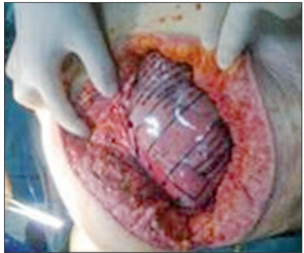
FIGURE 2: Closure of the abdomen with Bogota Bag. (See color figure at http://jinekoloji.turkiyeklinikleri.com/ )

Any patient undergoing a surgical procedure is at risk for developing complications. Abdominal distension is one of the most important postoperative complications. The physicians should consider paralytic ileus, mechanical ileus, foreign bodies, bowel