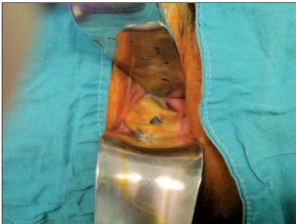
FIGURE 1: Speculum examination revealed a hard obstructing mass, the presence of which made us suspect a myositis ossificans or an advanced cancer.

pelvic pain for two years and urinary incontinence for eight months. The urinary leakage was continuous. A hard obstructing vaginal mass was felt in the pelvic examination and disclosed by the speculum examination (Figure 1). The mass was attached to the cervix and moving with the uterus. During the examination, continuous urine leakage from the vagina was observed. An operation was planned under general anesthesia in the lithotomy position and written informed consent was obtained. Vaginal douching with povidone-iodine was done 1 night before the surgery. The patient received intraoperative antibiotic prophylaxis with third generation cephalosporins and aminoglycosides. The mass was not able to be removed through the vagina and a laparotomy was performed with a Maylard incision. The bladder was opened after vesico-uterine peritoneum dissection, and the hard mass was seen inside of the bladder (Figure 2). Based on the patient's request, total abdominal hysterectomy and bilateral salpingo-oophorectomy were performed. Because the body was close to the ureteral orifices, a double J stent was inserted into the ureters following the mass removal (Figure 3). At the end of these procedures, a very large defect extended from the trigone to the bladder neck. The anterior and the posterior urethra were intact. The mass which was taken off, was suggested to be an aerosol cap. The fistula tract was excised circumscensibly from the living tissue margin. Closure of