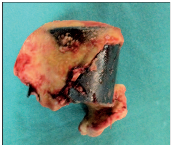
FIGURE 3: The object was approximately 3 cm in length and 4 cm in width. It is suggested that object was an aerosol cap.

(See for colored form http://jinekoloji.turkiyeklinikleri.com/ )