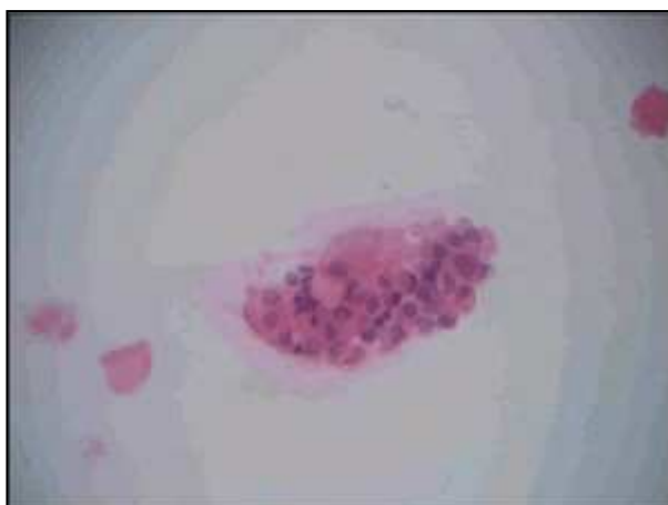
Figure 3. Atypic cells in peritoneal fluid (HE x 400).