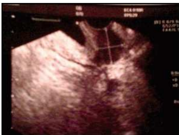
Figure 1. Right adnexial mass.

graphy showed a right sided complex, 2*3cm tubo-ovarian mass with solid and cystic components, 5*5*3 cm intramural leiomyoma of the uteri and minimal ascites in douglas (Figure 1). Ovaries could visualised normal separately. Patient was admitted to our clinic and investigated. All routine investigations including liver and renal function tests and tumor markers including CA-125 were within normal limits. Cytology detected normal cervical smear and fractional curettage showed normal endometrium. After complete pre-operative work up an exploratory laparotomy was performed. Intraoperative findings revealed leiomyoma of the uteri and dilated right fallopian tube with minimal ascites. However, both ovaries and left tube appeared to be normal. Total abdominal hysterectomy with bilateral salpingo-oophorectomy and peritoneal washing was performed. Peritoneum was visualised, to look for suspicious areas. Specimen was sent for histopathological examination. Histopathology report showed papillary adenocarcinoma of the right fallopian tube extending into the submucosa and muscularis without a penetration of the serosal surface (Figure 2). Peritoneal washing was positive (Figure 3). Thus the patient was diagnosed to be a case of primary fallopian tube carcinoma Stage IC and discharged on day 7 of surgery without any complication. Four cycles of adjuvant chemotherapy (carboplatin and paclitaxel) was performed after surgery.