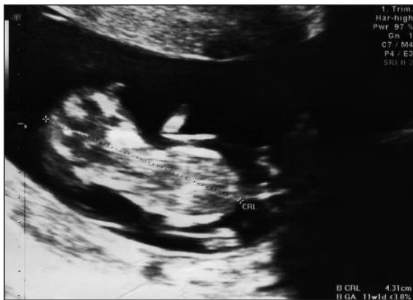
FIGURE 1A: Ultrasound image of an 11 weeks and 1 day old fetus according to CRL (crown rump length: 43.1 mm).

A 26-years-old woman with gravida 2, parity 1, abortus 1 was admitted to our prenatal screening centre. Her pregnancy was 11 weeks according to her last menstrual period. Ultrasound was revealed an 11 weeks and 1 day old fetus according to CRL (crown rump length: 43.1 mm) (Figure 1A, B). The embryos were fused to each other at the thoracic and abdominal regions. There was two fetal heads facing each other with one trunk, abdomen, four arms and legs; the pelvises were not conjoined. Single conjoined heart was detected with color doppler ultrasonographic examination. The parents wanted to medical termination that was done by