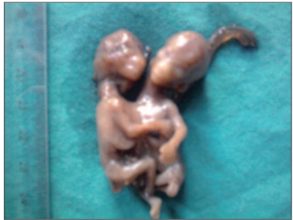
FIGURE 2: Postnatal image of thoraco-omphalopagus twins. (See for colored form http://jinekoloji.turkiyeklinikleri.com/ )

400 mg intravaginal misoprostol. The weight of aborted twins was 15 g and twins were joined from thorax to umbilicus (Figure 2). In postnatal examination, two fetal heads, hyperextension spines, single heart, shared liver, separated stomach and bladder, four arms and legs, single umbilical vein, three umbilical arteries were detected.