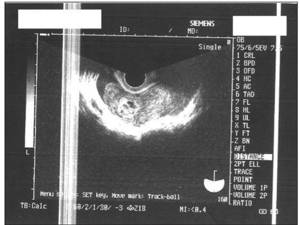
FIGURE 1: Ruptured ovarian ectopic pregnancy.

Transvaginal ultrasound examination revealed an image on right adnexial region that was suitable with ruptured ectopic pregnancy (Figure 1). Left adnexa was observed as normal. Endometrial thick-