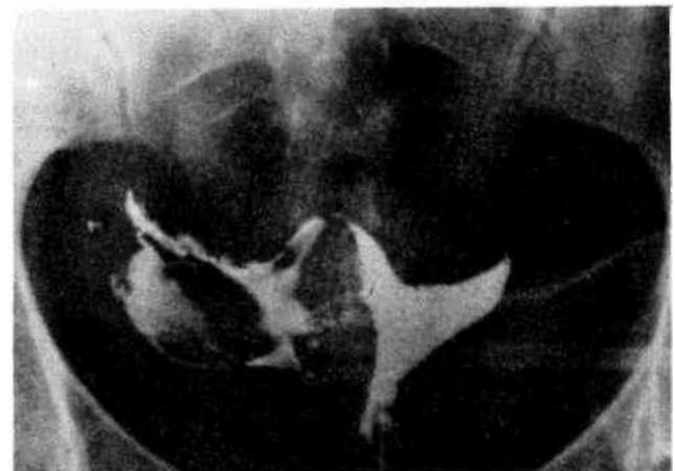
Figure 3. Şekil 3.

of these patients, the vision was so troublesome that, sharp curettage of the cavity had to be performed before division of the septum was initiated. Post operative HSGs revealed satisfactory cavities (less than 1 cm notch) in most of the patients. In only 1 patient, a 2 cm fundal notch was present who underwent a repeat resection.