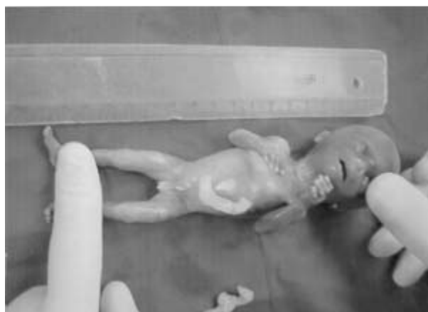
Figure 2. Well developed stillborn infant measuring 17 cm from crown to heel. The fetus was lying in the pelvic cavity and was attached to the placenta with the umbilical cord.

the placenta was removed by salpingectomy. The patient had an uneventful postoperative course and was discharged on the fifth postoperative day.