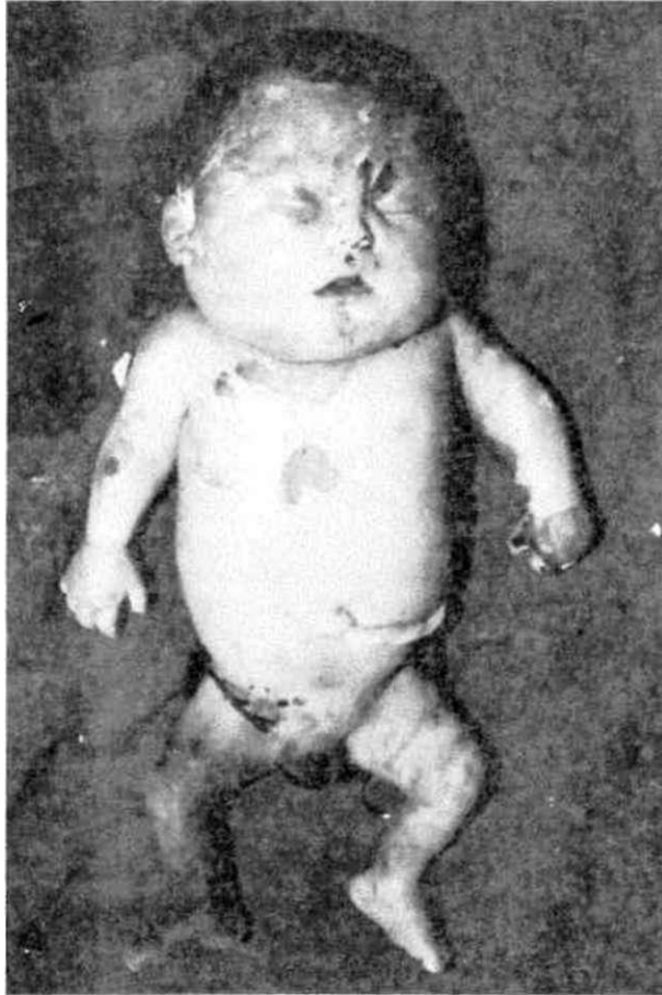
Figure 2. Appearance of hydropic fetus after delivery.

On the initial sonographic examination in our clinic, generalized oedema all around the fetus, moderate hydrothorax and moderate ascites in the abdomen was detected (Figure 1). The nuchal fold thickness was 11 mm.s. The four chamber view of the heart couldn't be identified clearly. At his profile flattened face was identified. The diameters of the extremities corresponded with the gestational age. The kidneys were demonstrated to be normal. By these ultrasound findings no any spesific condition was thought which might cause to hydrops fetalis. Chordosynthesis was carried out to karyotype the fetus. At her second scanning which was performed one week later at 29 weeks of gestation, it was observed that the degree of hydrops fetalis became more severe than it was. Chromosome analysis of red blood cells of fetus revealed a 47 XY + 21 karyotype, indicating the diagnosis of Down syndrome. The couple opted to terminate the