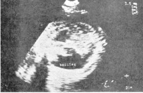
Figure 1. Ultrasonographic appearance of hydrothorax which was detected at 28 weeks of gestation.

A 35-year-old woman, gravida 1, para 0, was referred to our clinic with the diagnosis of hydrops fetalis which was detected at 28 weeks of gestation in her